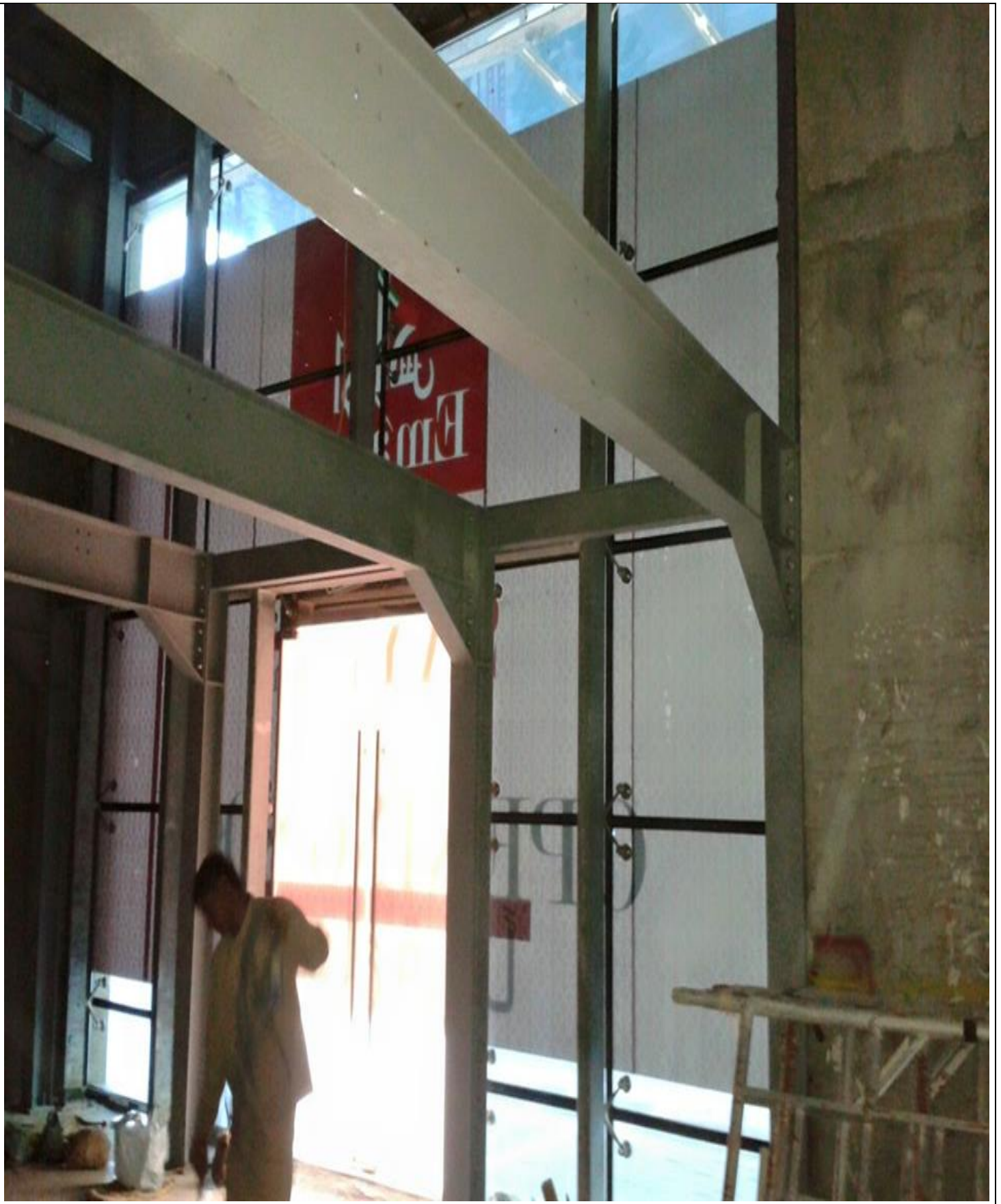
Art Designing & Decor Work Mezzanine Floor