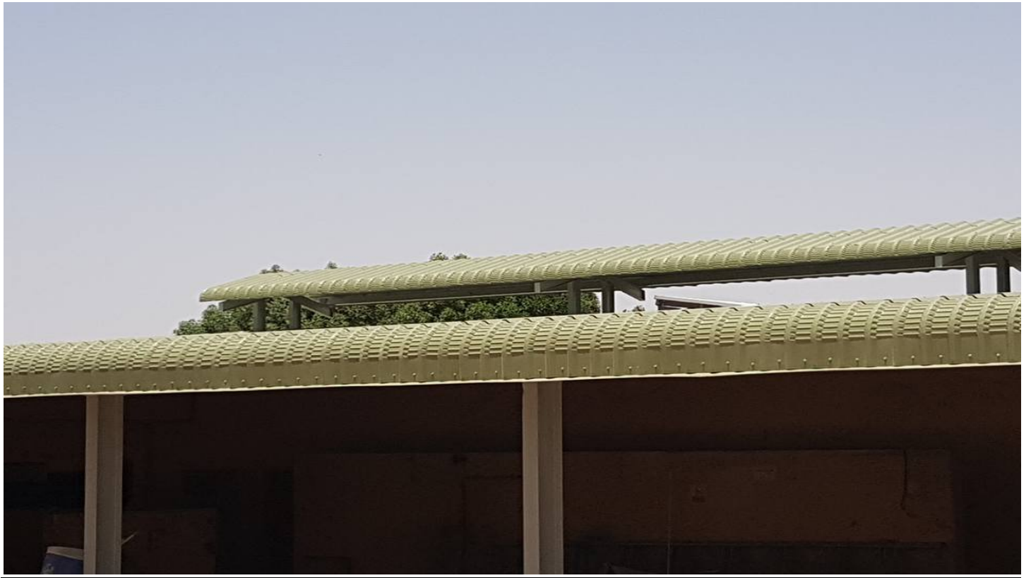
Al Rawabi Dairy farm Steel Structure