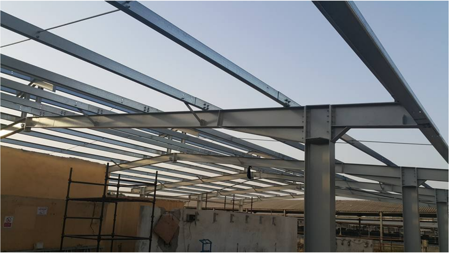
Al Rawabi Dairy farm Steel Structure